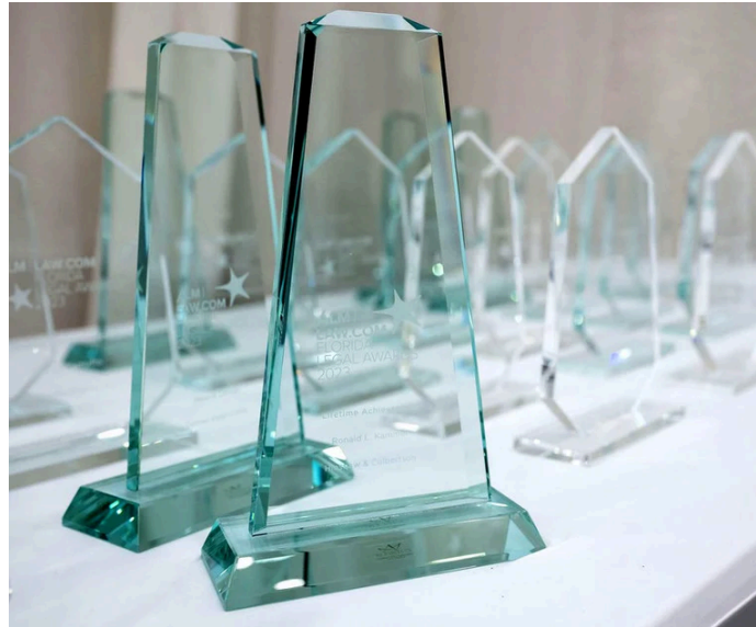
2023 Florida Legal Awards at JW Marriott Marquis in Downtown Miami.